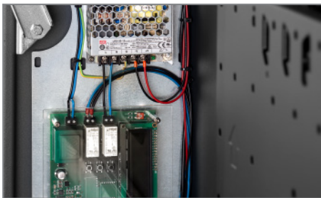
Cabling according to VDE guidelines

Optionally, the totem can be customized in special RAL colours or with a logo as film plot.