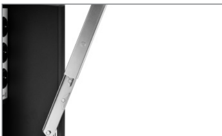
optimal service access